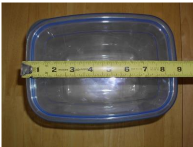
1- large reservoir or reservoir support container 8 3/4" long X 6 1/4" wide X 6 5/8" high.