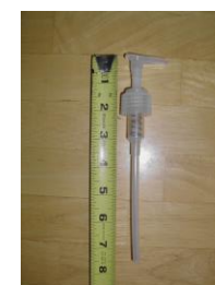
Pump 2 Length: 7 5/16"