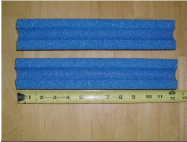
2 - canal pieces - 12" long