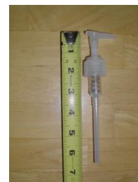
Pump 1 Length: 6 5/16"