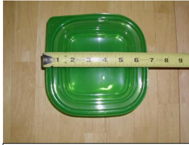
6 – short reservoir or reservoir support containers - 6 5/8" wide X 2" high